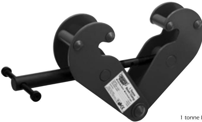
1 tonne Beam Clamp shown.

IMPORTANT: PLEASE READ THESE INSTRUCTIONS CAREFULLY TO ENSURE THE SAFE AND EFFECTIVE USE OF THIS PRODUCT.